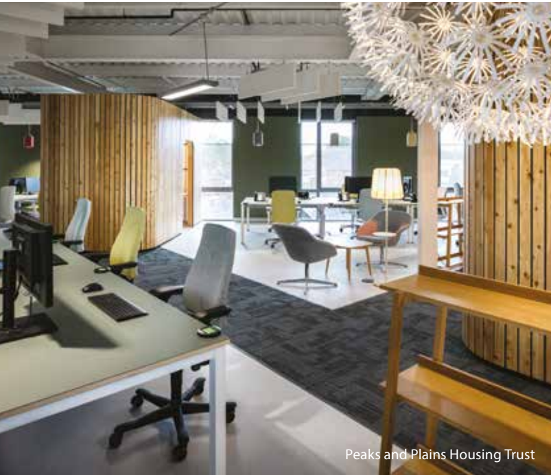
Peaks and Plains Housing Trust

For more information on our floor finishes that work together, please visit www.forbo-flooring.co.uk/government